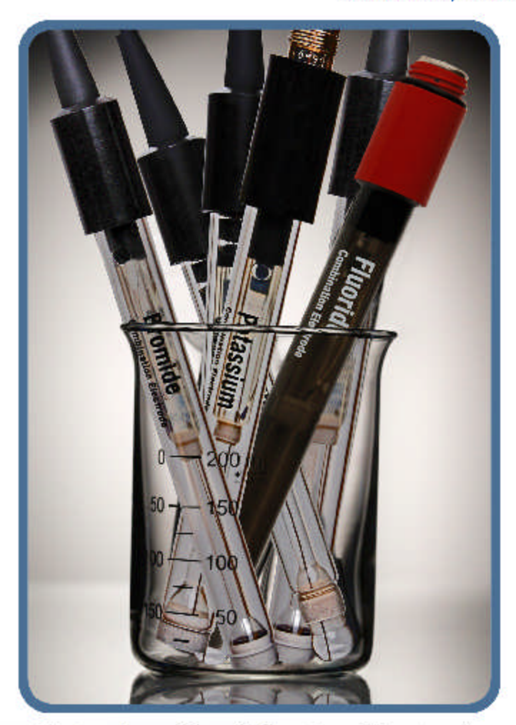
Potassium Ion Selective Electrode